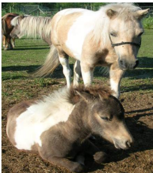
Cheeco and his Mom Honey

Is three years old and was born here at Hearts & Hooves. We hand raised Cheeco after his mom had to be put to sleep from untreatable damage caused to her by abuses she faced before joining us here. Cheeco is a pet, he loves everyone.